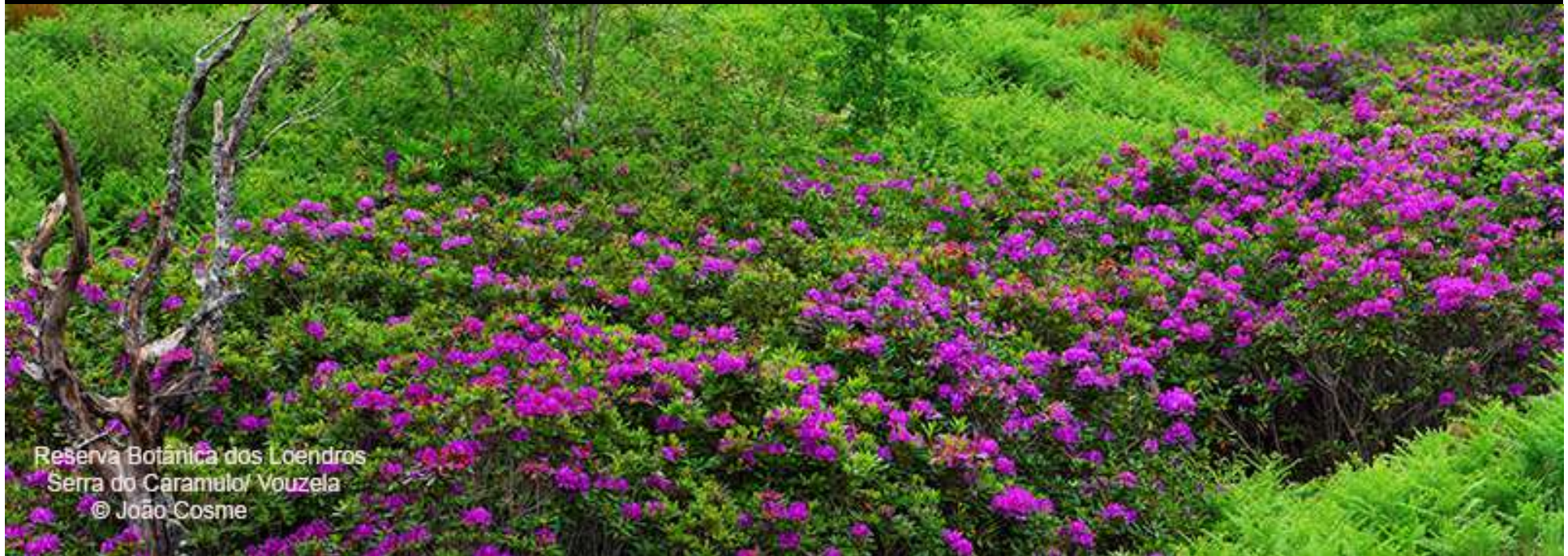
Pontic rhododendron ( Rhododendron ponticum ssp. baeticum )